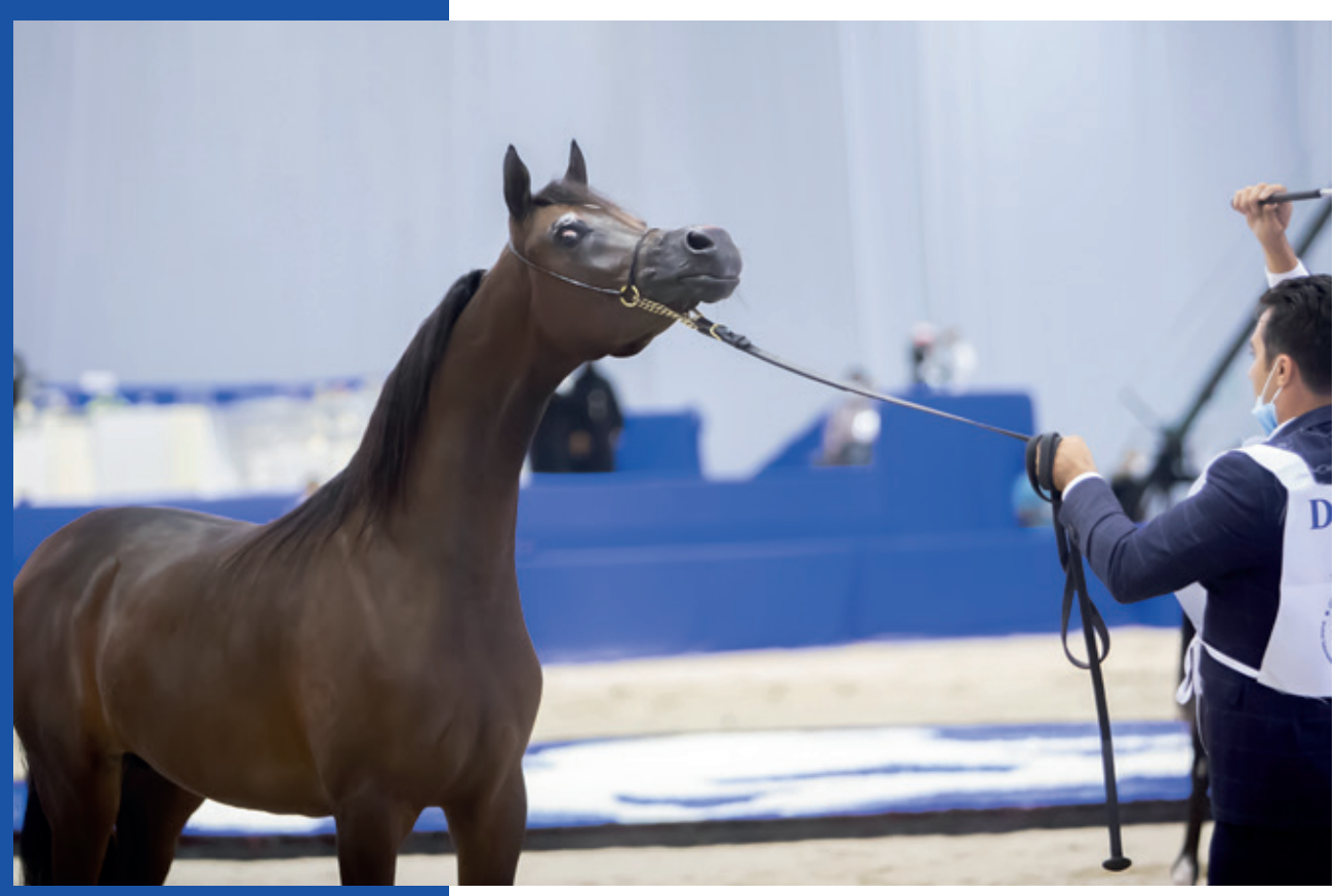
D RASEL FA EL RASHEEM X LADI VERONIKA B/O: DUBAI ARABIAN HORSE STUD