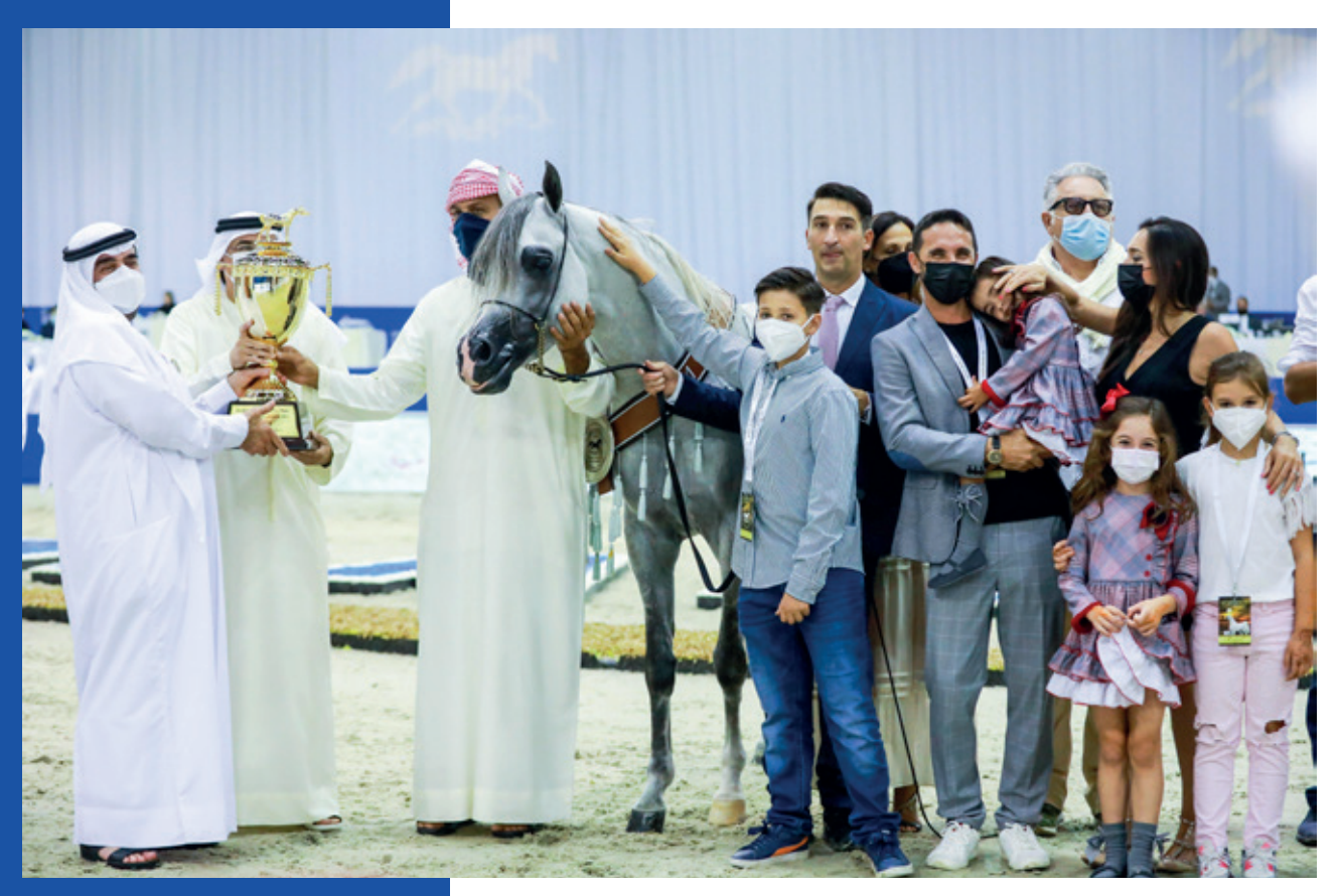
D SERAJ FA EL RASHEEM X LADI VERONIKA B/O: DUBAI ARABIAN HORSE STUD